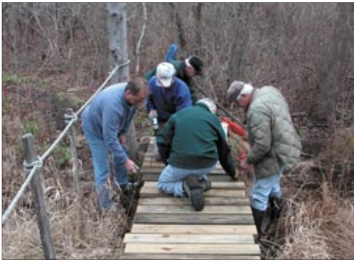
PCLT volunteers working on a bridge at the Sterling Farm Preserve in Patterson (see "PCLT Stewards" on page 7)