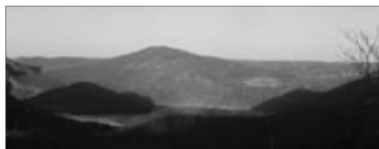
Mt Taurus viewed from Storm King Mountain